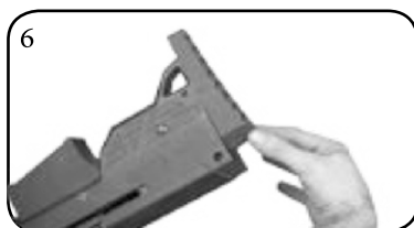
6. Remove the rubber pad as shown in the Picture.