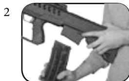
2. Remove the magazine