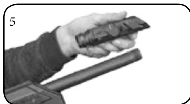
5. Then remove the flash hider