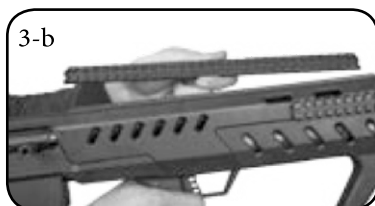
3. Untie the upper rail screw.