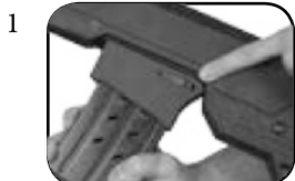
1. Press the magazine release button.

4- Make sure the last round in the chamber has been extracted and ejected. Visually and physically check the chamber and the magazine well to make sure the shotgun has been fully unloaded. Perform a safety check by physically inserting your index finger in the chamber to feel for the presence of a round or cartridge case in the chamber.