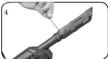
4. Remove the flash hider screw.